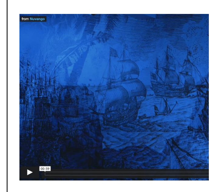
Talking Point: Carnovsky