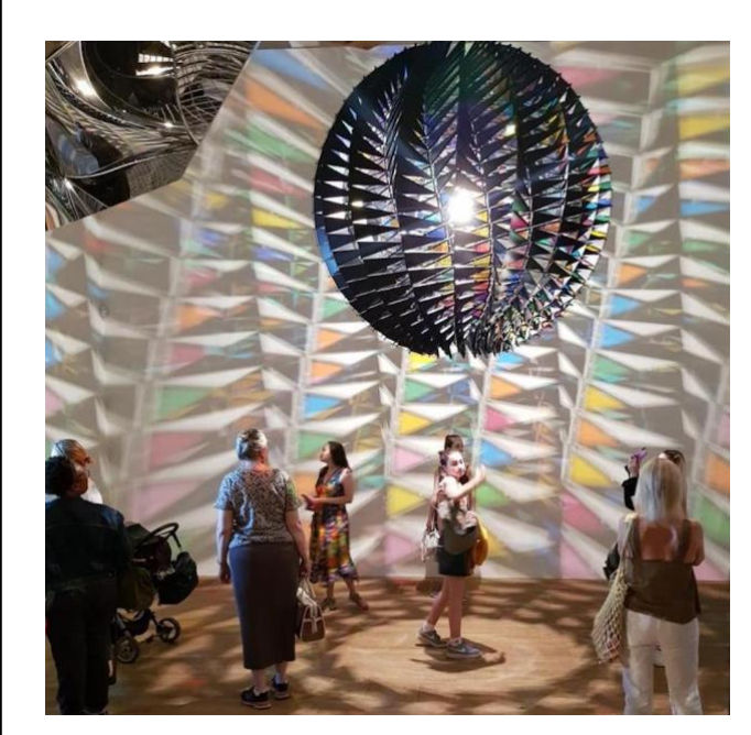
Talking Point: Olafur Eliasson