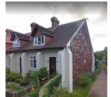
4 Squires Cottages is tile hung on the end.