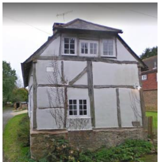
Jessamine Cottage, built in 1390 (the oldest building in Bury) is timber framed .