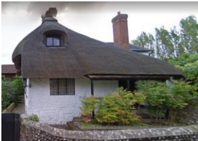
Fogdens hall house