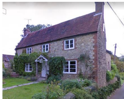
This cottage is made from stone with brick edging.