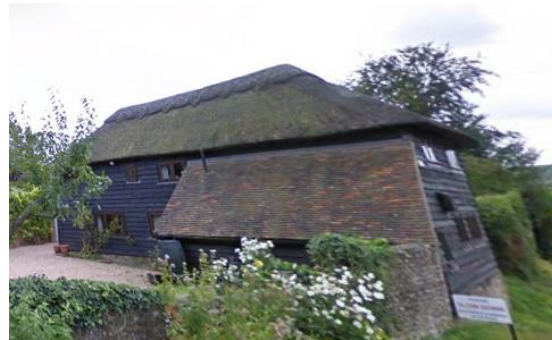
This converted barn is clad in wood with a thatched roof.