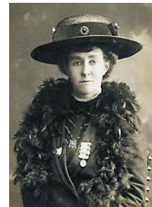
Emily Davison Born: 1872 in London, England Died: 1913