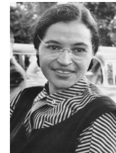
Rosa Parks Born: 1913 in Alabama, USA Died: 2005