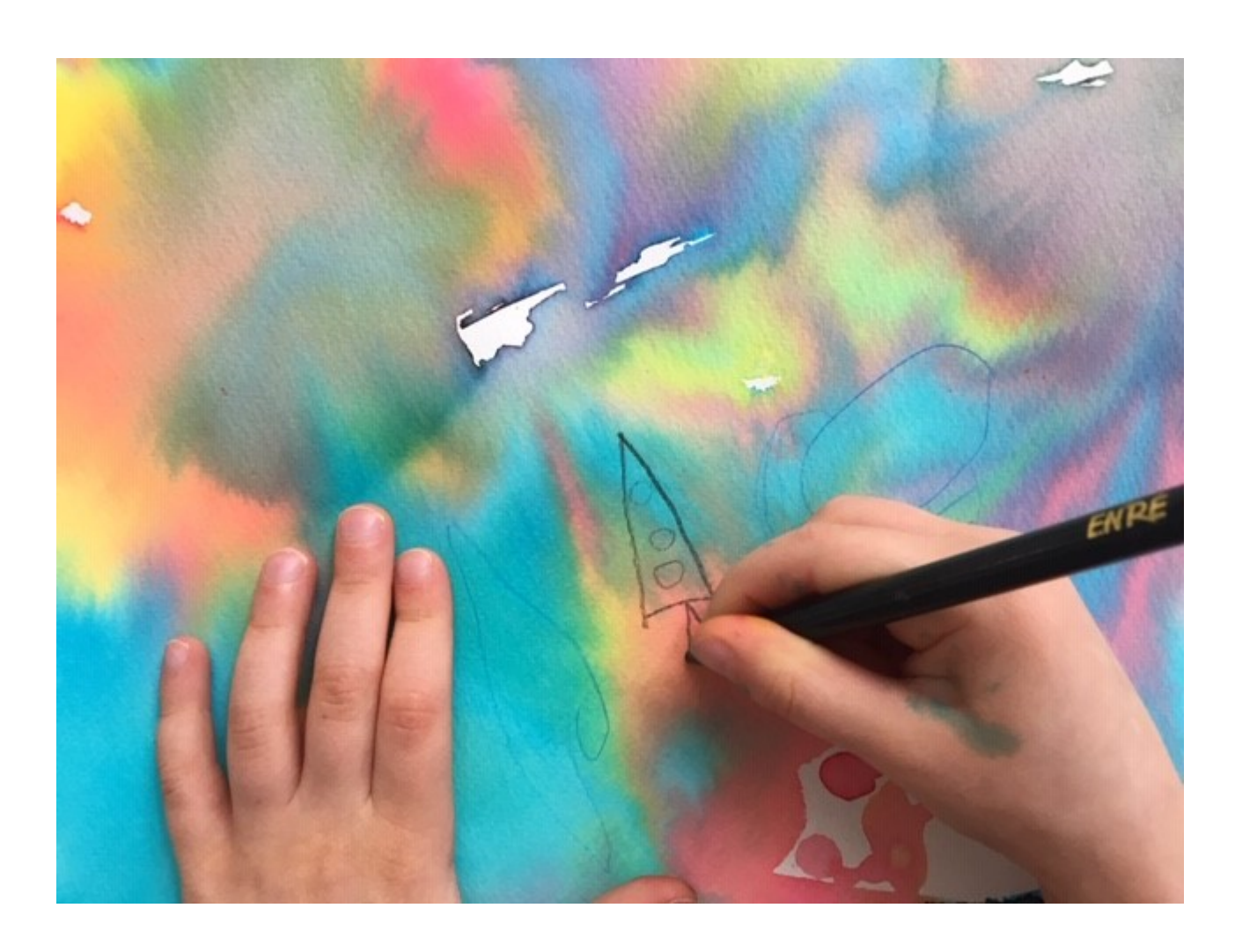
Next came a rocket!