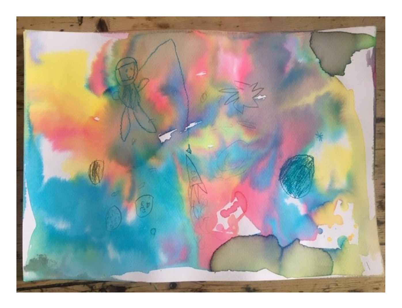
You can see more of Rachel's resources here.

This is a sample of a resource created by UK Charity AccessArt. We have over 1100 resources to help develop and inspire your creative thinking, practice and teaching.