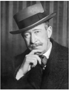
Lord Carnarvon Funded the archaeological search for Tutankhamun's tomb.