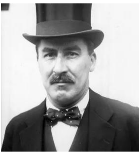
Howard Carter 1874 – 1939 Discovered Tutankhamun's tomb in 1922