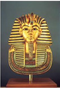
King Tutankhamun (reign 1332–1323 BC)