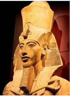
Pharaoh Akhenaten (reign 1351–1334 BC)