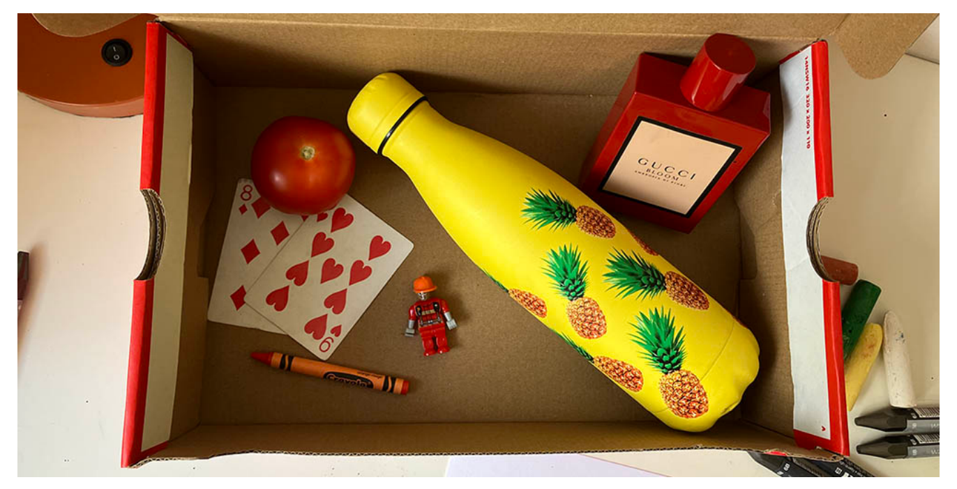
A collection of things I like

Once children have decided on the theme of their collection, give them time to collect between 5-10 objects. Once they have picked up their items they can start to arrange them in a box. Encourage students to be creative with their compositions. They may want to have objects interact with each other, arranged into a shape or have some objects stand and others lie down.