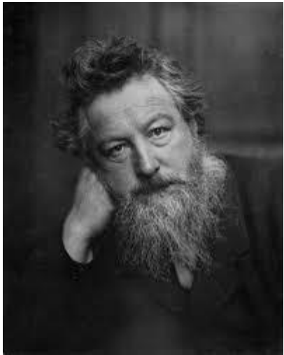
William Morris 1834 - 1896