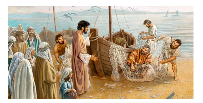
Jesus called for the disciples to be 'fishers of people'.