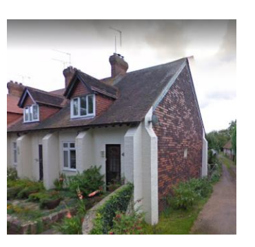
4 Squires Cottages is tile hung on the end.