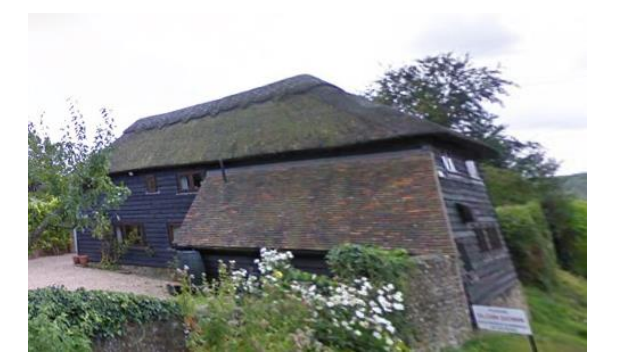
This converted barn is clad in wood with a thatched roof.