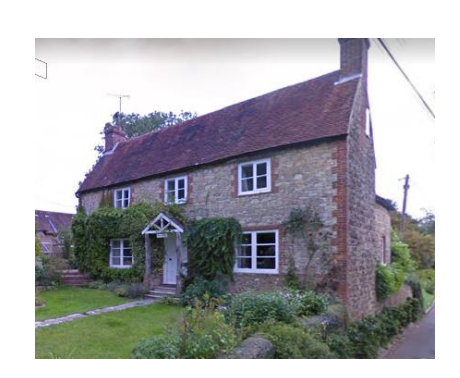
This cottage is made from stone with brick edging.