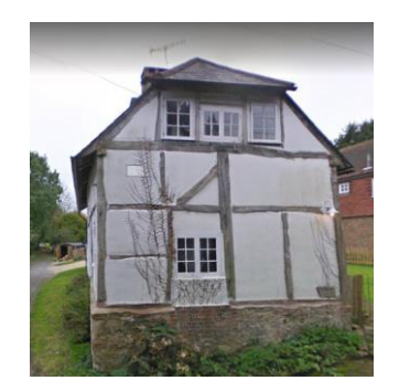
Jessamine Cottage, built in 1390 (the oldest building in Bury) is timber framed.