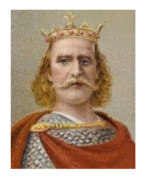
Harold Godwinson Also called Harold II, was the last crowned Anglo-Saxon king of England