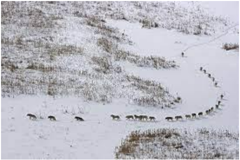
The strongest wolves go at the back of the pack so that none are left behind and the weakest wolves are protected.