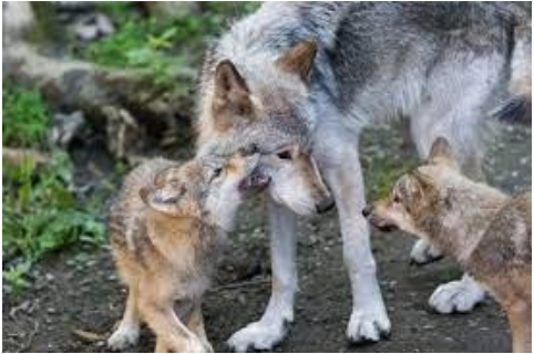
Only the alpha couple are allowed to breed and produce pups.