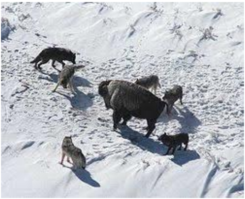
Wolves work as a pack to catch prey like this buffalo.