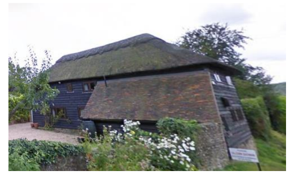
This converted barn is clad in wood with a thatched roof.