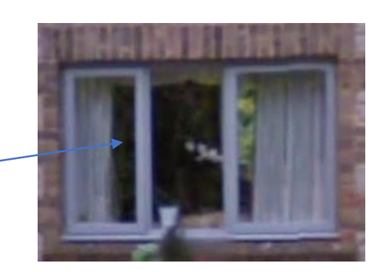
Modern plastic windows with larger panes of glass