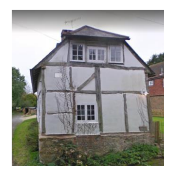
Jessamine Cottage, built in 1390 (the oldest building in Bury) is timber framed.