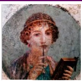
Sappho 630 -570BC