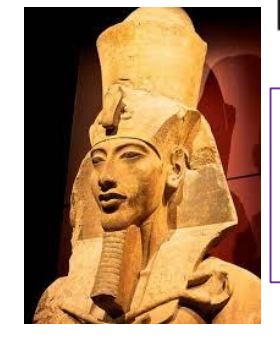
Akhenaten (reign 1351– 1334 BC)