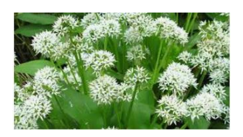
Wild garlic found in woodlands in spring