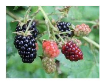
Blackberries found in hedgerows in autumn