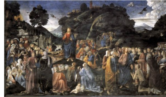
'The Sermon on the Mount' by Cosimo Rosselli